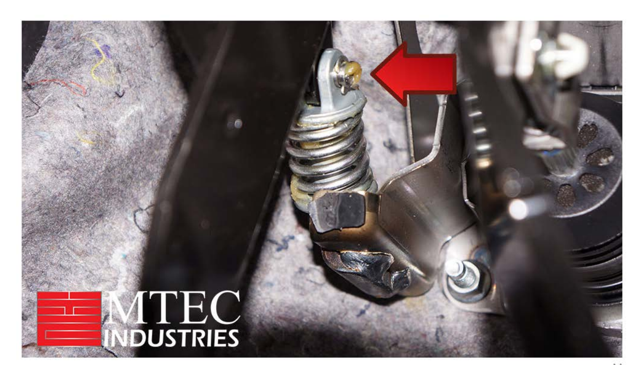
Remove C Clip.

Wipe clean of any grease around the area.